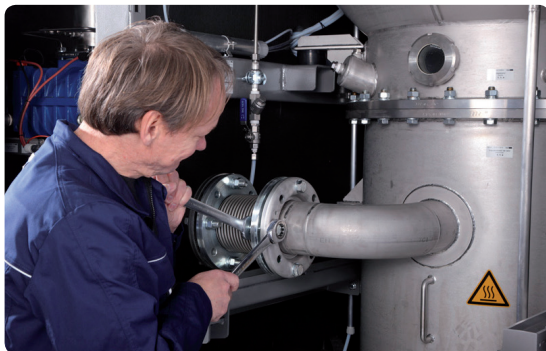
Preventive maintenance increases system availability. Our service technician's expert know how ensures reliability of your VACUDEST vacuum distillation system.

Our offer is complemented by a number of other advantages, such as professional support by our application center for zero liquid discharge and free operator training programs at our main plant in Steinen. In addition, we will contact you automatically whenever system maintenance becomes necessary. You can count on us.